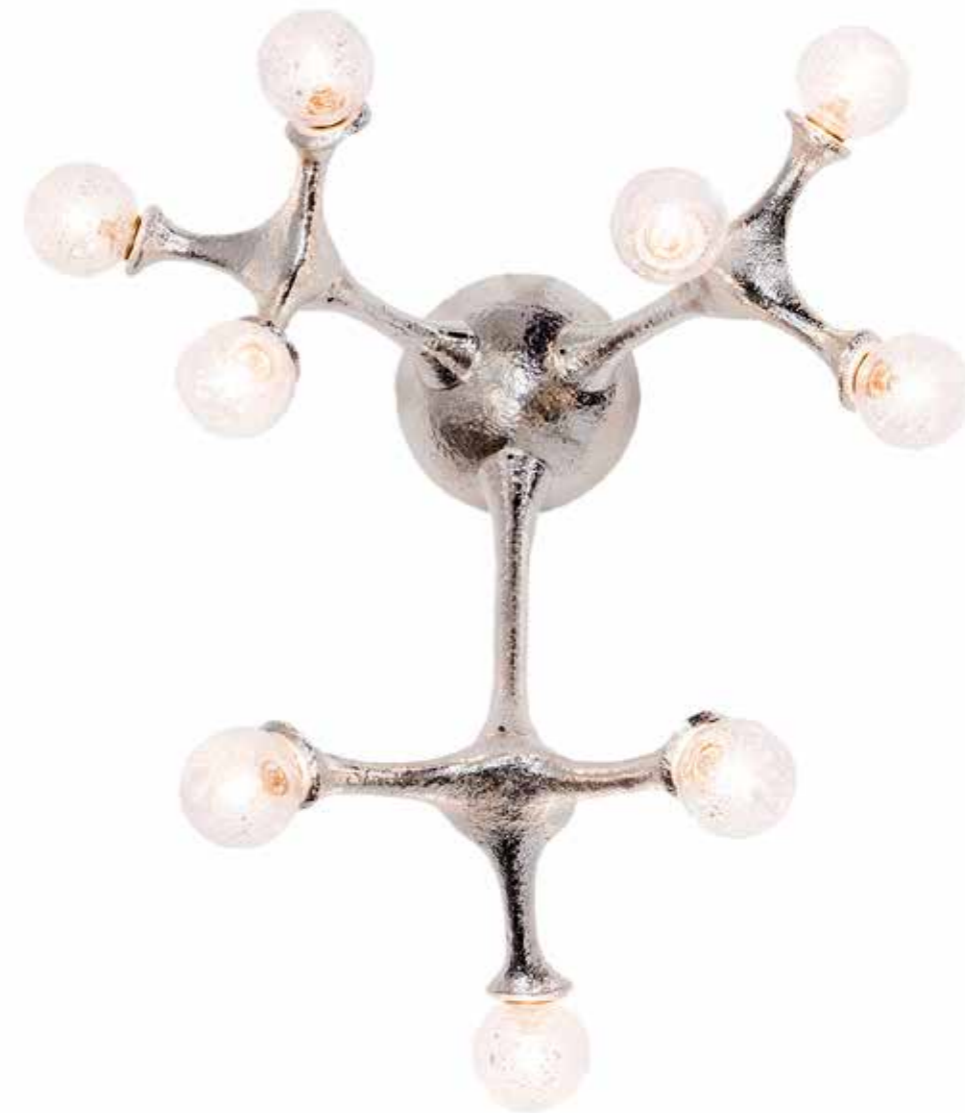
Itemnr: PA 893 Model: Organic Atomic wall sconce Sockets: 9x G4 LED Finish: -Dutch Silver -Canadian Gold Dimensions: L50xD40xH55cm

* Custom sizes on request. For images of the other finishes visit our website.